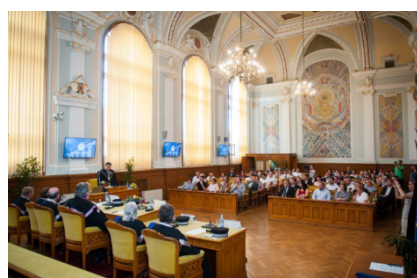
Presentation of the speech in the Aula Magna of UBB