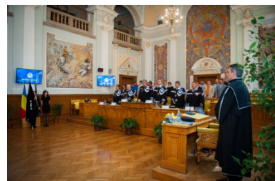
Singing the anthem