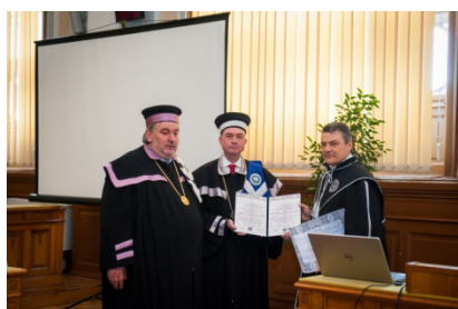
Awarding of the PHC diploma